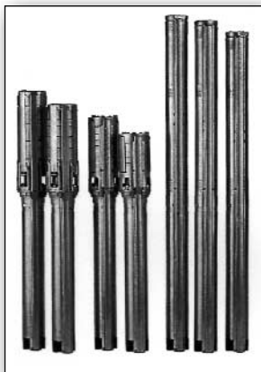
SQ Flex Pumps