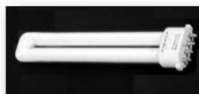
PL Compact Fluorescents