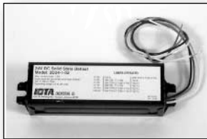
Fluorescent DC Ballast