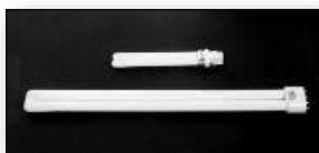
RL001 (top) and RL002 Compact Fluorescents