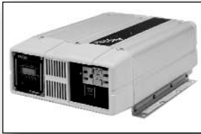
PROsine 1000 Inverter