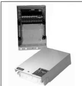
PSPV Combiner Box

The PSPV Power System PV Array Combiner provides series overcurrent protection of PV module circuits allowing NEC compliant installation. Includes space for up to twelve 125 VDC rated breakers or eight 600 VDC rated fuse holders. Includes two positive output bus bars with two #1/0 terminals for single or dual output circuits. The type 3R outdoor rainproof enclosure can be mounted vertically or inclined to 14 degrees. Enclosure only without breakers or fuses.